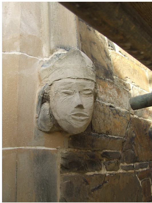
Replica Stone Carvings