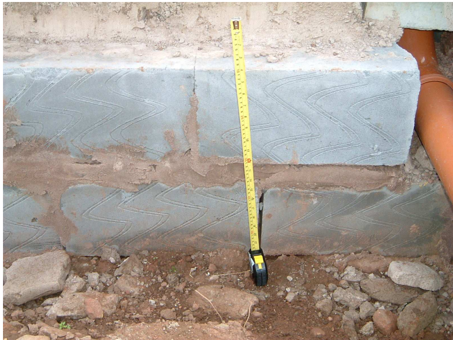
50mm Bed Joints