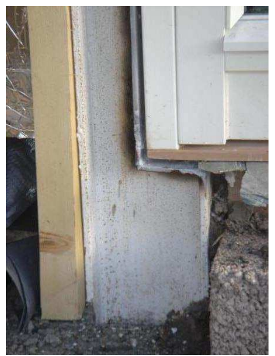
When a Support Column Clashes with a Window